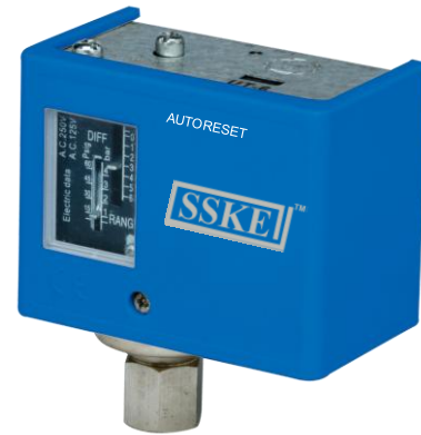
COMMERCIAL PRESSURE SWITCH, SSKE43-1