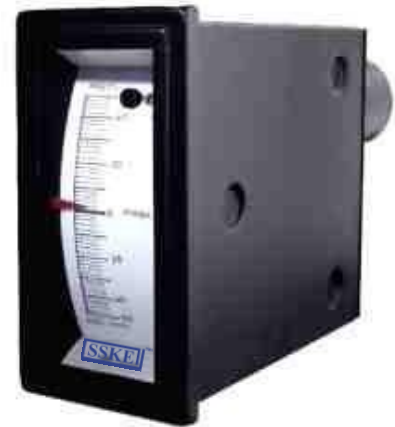
DRAFT GAUGE , SSKE17