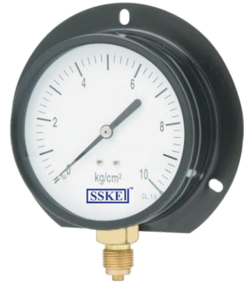
COMMERCIAL PRESSURE GAUGE, SSKE05-2